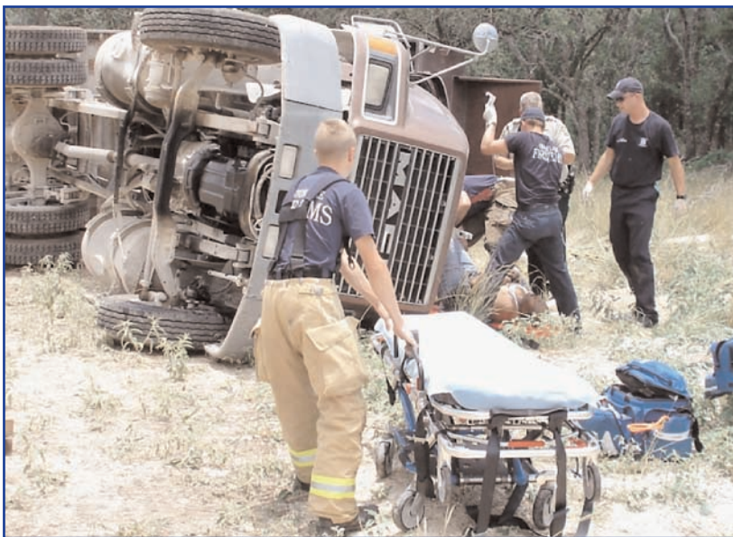
Emergency medical technicians work to rescue a truck driver in a rollover.